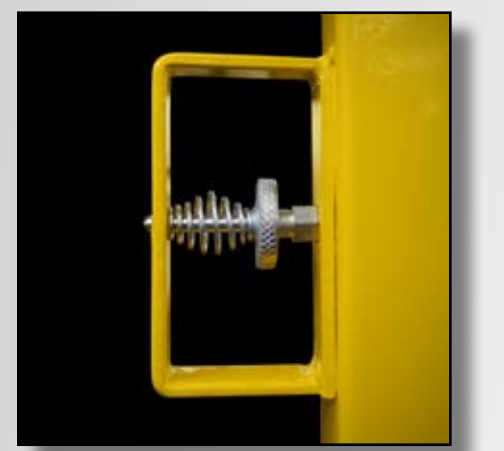
User friendly squeeze-lock is spring loaded to maintain the locked position at all times except when released for adjustment. A locking knurled knob is provided to prevent unintentional release. Additional snap pin is provided as a dual locked scaffold system.

INDY-GRT 6' Guard rail set w/ toe board 72 lbs.