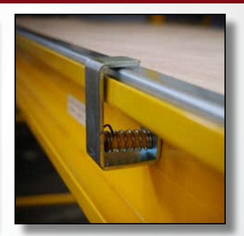
Steel edge banding protects all four sides of the exterior-grade plywood work platform without using rivets, screws or staples. Hand holds on each side provide ease in handling. Platform is held in place with spring-loaded retaining clips.

Four platform alignment pins provide a positive and secure fit for the work platform. Adjustment of the work platform is possible without disassembling the scaffold unit.