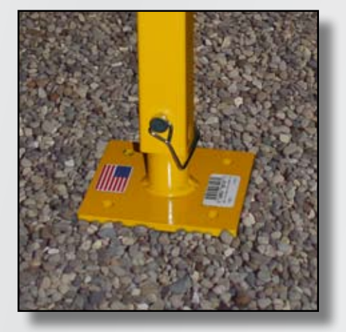
4" x 4" Baseplates provide a solid foundation for scaffolds in areas where casters can't be safely used. Great for use on stairways.