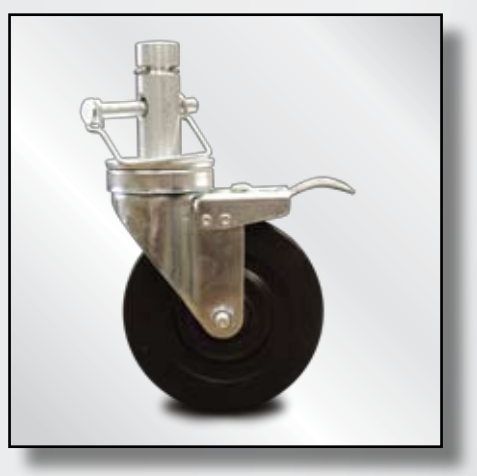
5" swivel casters with dual brakes that prevent both rolling and swiveling when brake lever is depressed. Caster stem includes compression ring and a 2" snap pin to attach the caster to the scaffold.