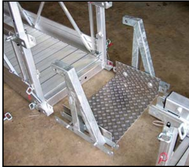
2. Slide steel frames onto deck section.