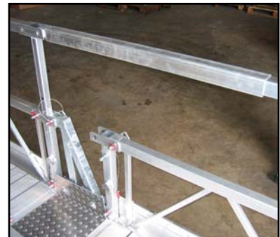
5. Finished guardrail installation.

Install Walk Thru Type Stirrup on this side of Hinge Section