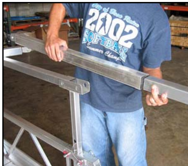
5. Slide hinge section guardrail over platform guardrail.