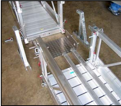
1. Hinge Section Parts.